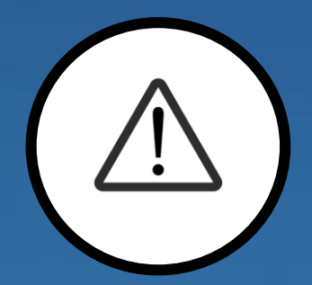
RISKS Early movers take brunt of risk, impedes pioneering investments