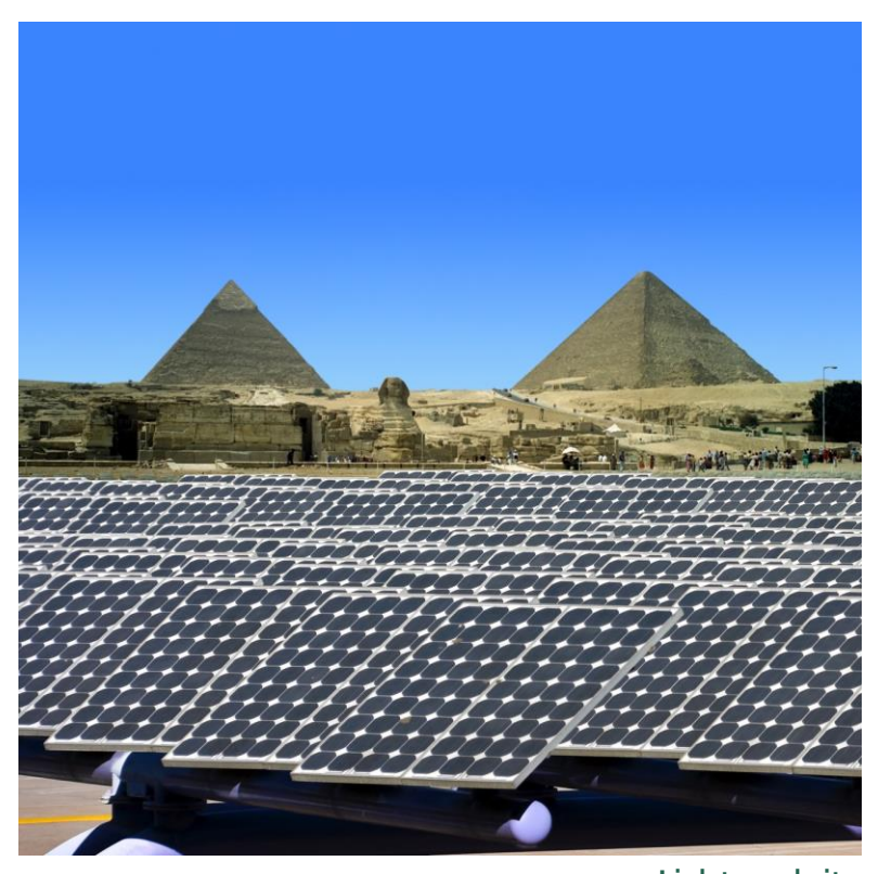
Link to website